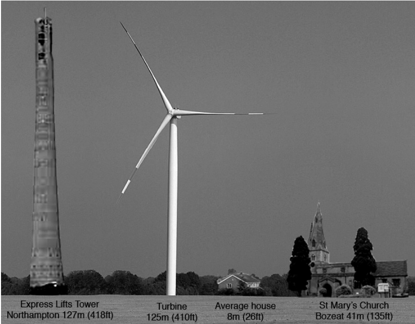
Express Lifts Tower Northampton 127m (418ft) Turbine 125m (410ft) Average house 8m (26ft) St Mary's Church Bozeat 41m (135ft)